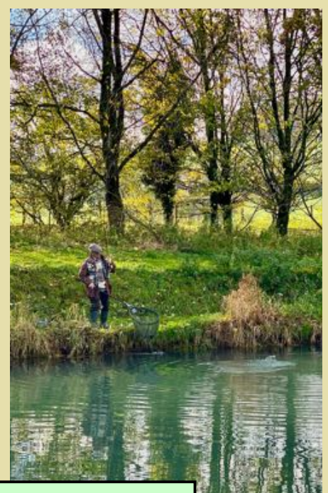
To view these photo's in more detail see them at the SMFF web page.