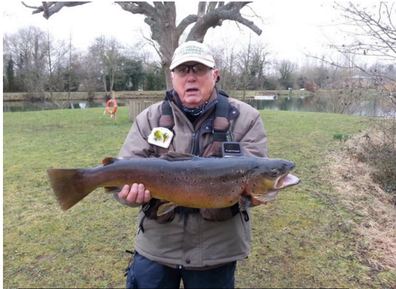
Fancy catching one like this Lechlade Brown Trout