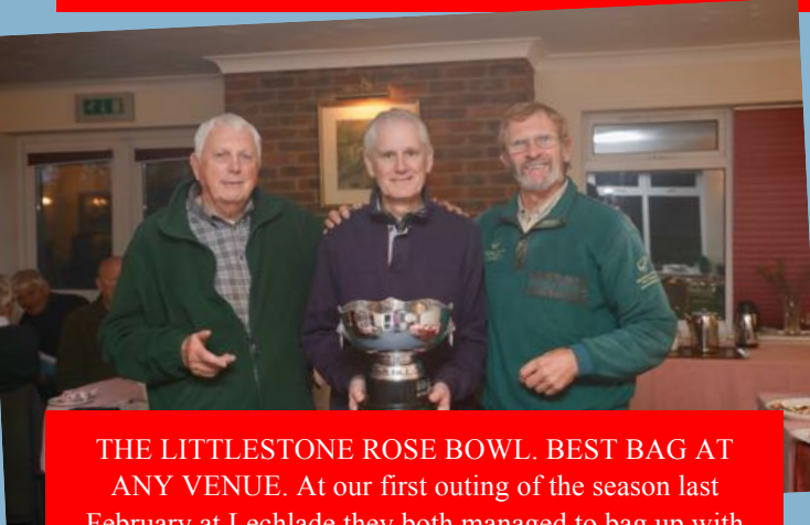
THE LITTLESTONE ROSE BOWL. BEST BAG AT ANY VENUE. At our first outing of the season last February at Lechlade they both managed to bag up with four fish each weighing 32lbs 6ozs. You have to share the