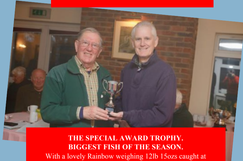
THE SPECIAL AWARD TROPHY. BIGGEST FISH OF THE SEASON. With a lovely Rainbow weighing 12lb 15ozs caught at