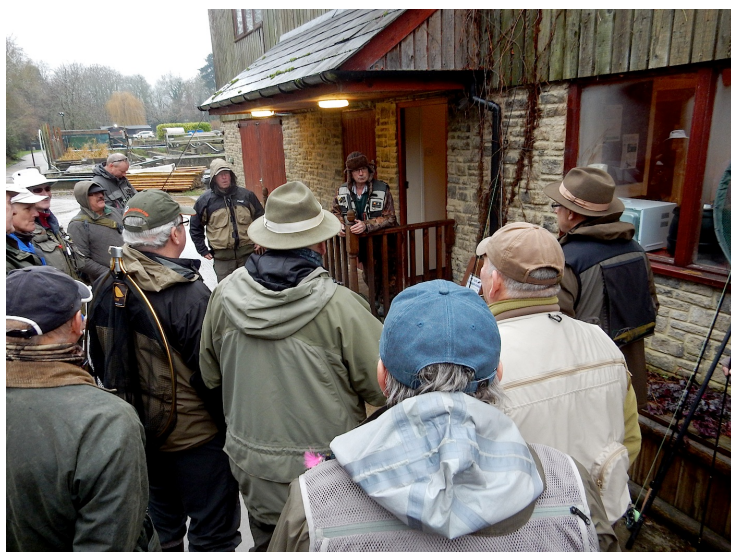
HON SEC GIVING THE BRIEFING

LECHLADE & OUR AGM Sat 12 th December 2015