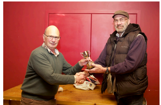
Your Hon Sec two awards, one for best fish 11lbs 13ozs at Meon and the Handicap Trophy. It was not a fix HONEST