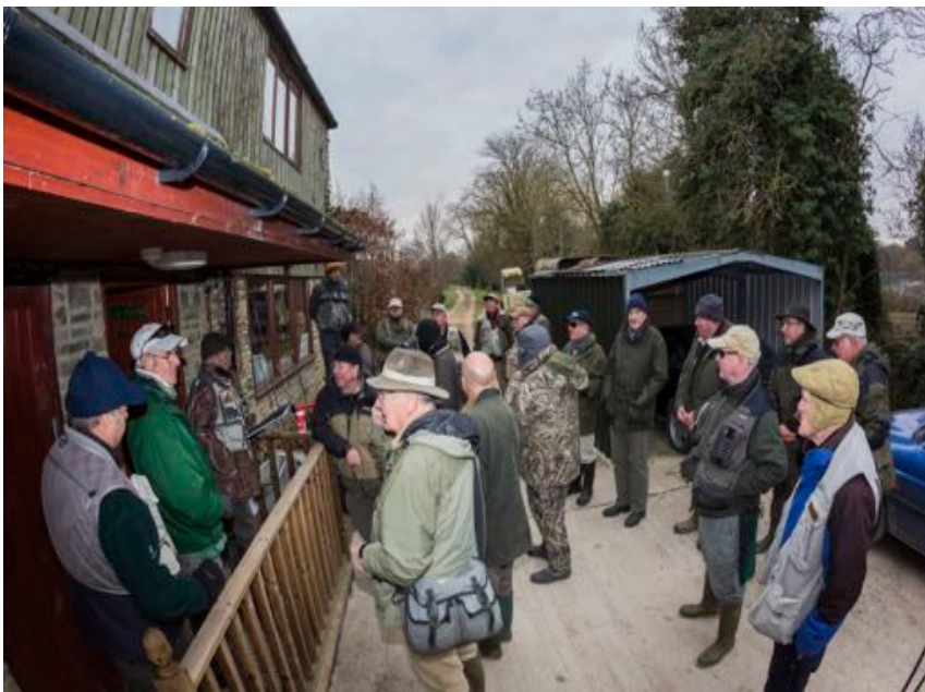
HON SEC GIVING THE BRIEFING LECHLADE

LECHLADE FEB 27 th DUNCTON MILL MARCH 12 th