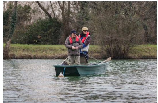
2 Men In A BOAT