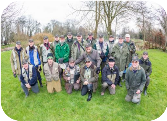
All wearing the new hats.