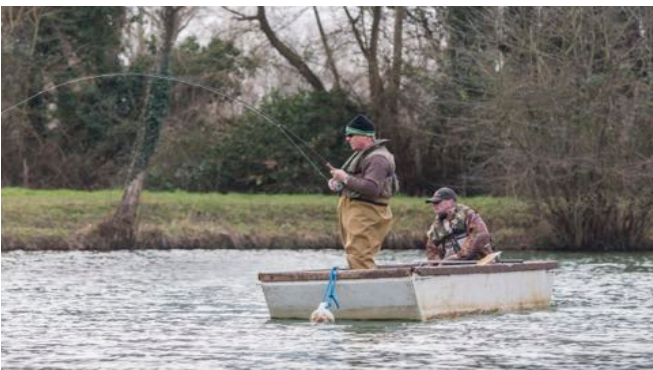
ALL LECHLADE PHOTOS