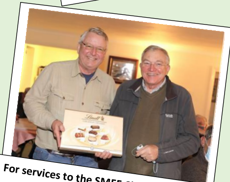
For services to the SMFF Club an award of a Box of chocolates