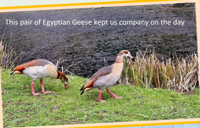
This pair of Egyptian Geese kept us company on the day